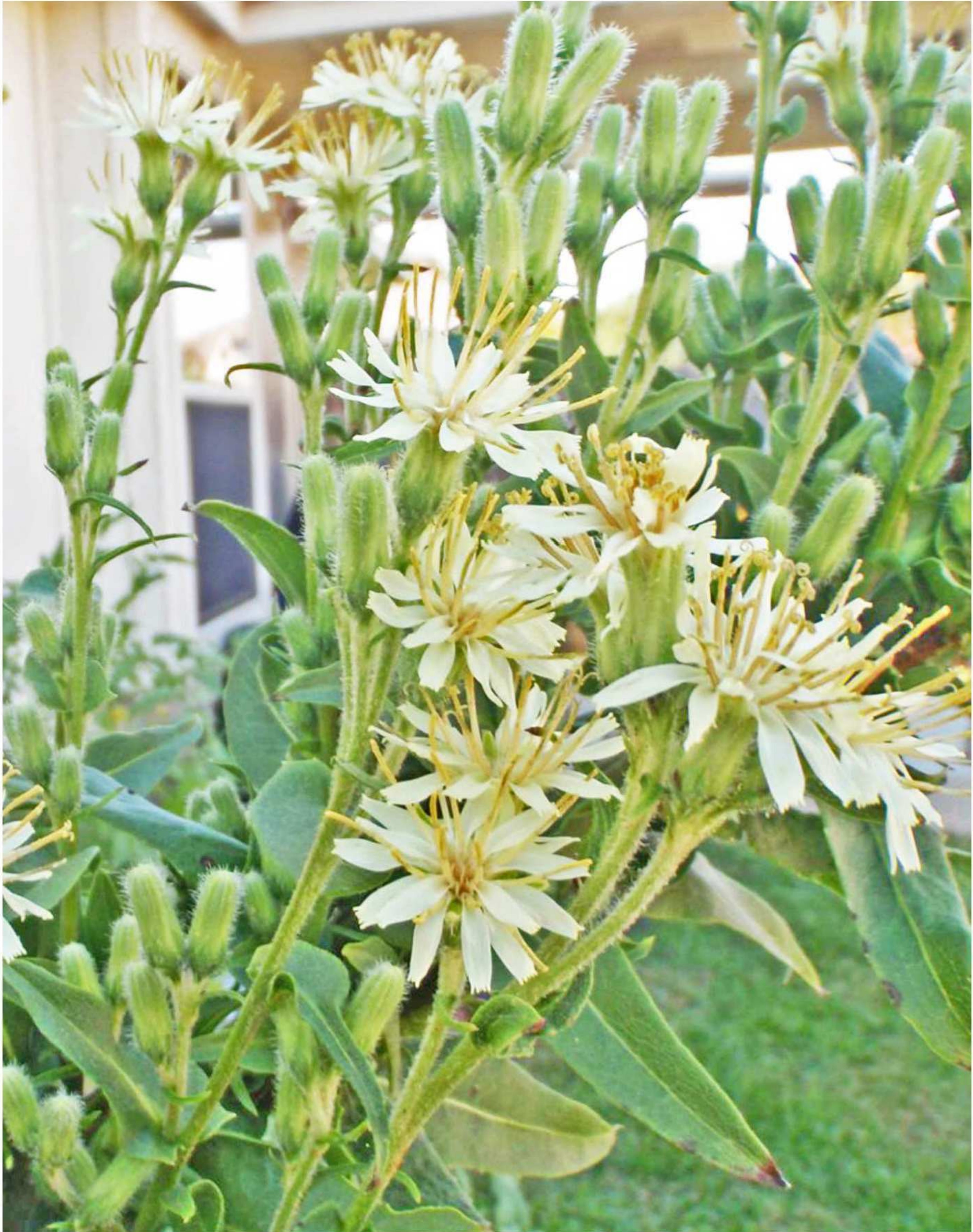
Figure 2. Prenanthes aspera (Singhurst 18337, BAYLU). Part of the photo in Figure 1.